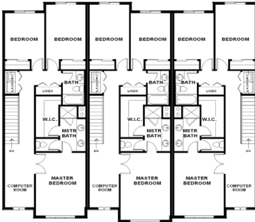
UNIT 1 SECOND FLOOR PLAN 986 SQ. FT. STAIR AREA INCLUDED