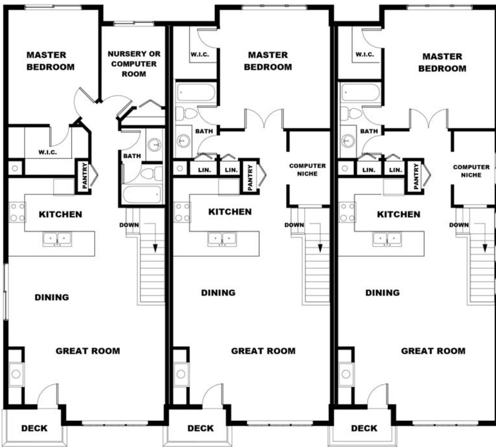
SECOND FLOOR 995 SQ. FT.