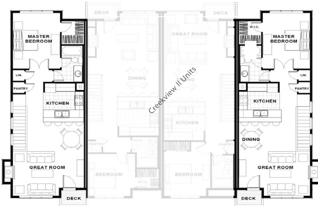
UNIT 1 SECOND FLOOR PLAN 813 SQ. FT.